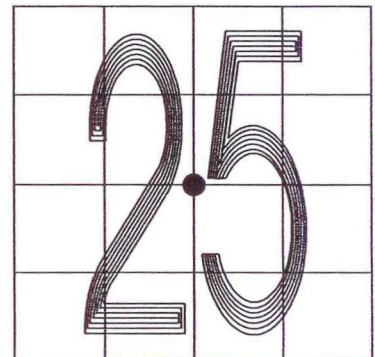
CORNER LOCATION IN THE SECTION